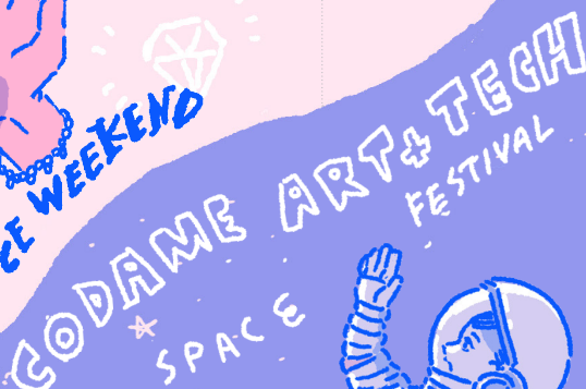
SAN FRANCISCO, CA OCT. 25-27

» San Francisco's best live storytellers (we admit, we're biased) will head up north for one night of Pop-Up Magazine's Fall Tour.