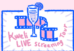
Los Angeles, CA SEPT. 14

» Focus your viewfinders on the same landscapes as iconic photographer Ansel Adams, whose work was both artform and environmental activism.