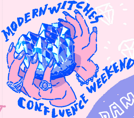
San Francisco, CA OCT. 18 - 20