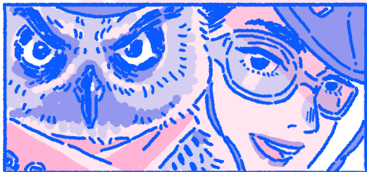
Waterford, CA OCT. 4-6

» Hosted by music label Dirtybird Records, this imaginative weekend music fest transports grownups back to those childhood days of summer camp, with the appeal of the adult, all-night rave.