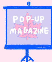
Vancouver, BC SEPT. 28

» Legendary Chicano labor leader and civil rights activist Dolores Clara Fernández Huerta will share her enthralling stories to inspire future social justice supporters.