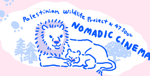
Oakland, CA SEPT. 22