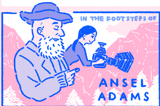
Yosemite National Park SEPT. 14 - DEC. 31

» Focus your viewfinders on the same landscapes as iconic photographer Ansel Adams, whose work was both artform and environmental activism.