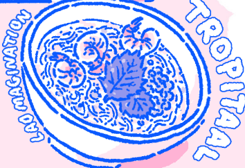
Oakland, CA SEPT. 27