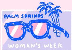
Palm Springs SEPT. 29 - OCT. 5

» Join streaming platform kweliTV for a traveling brunch event celebrating award-winning short films, docs, and digital series from the African diaspora.